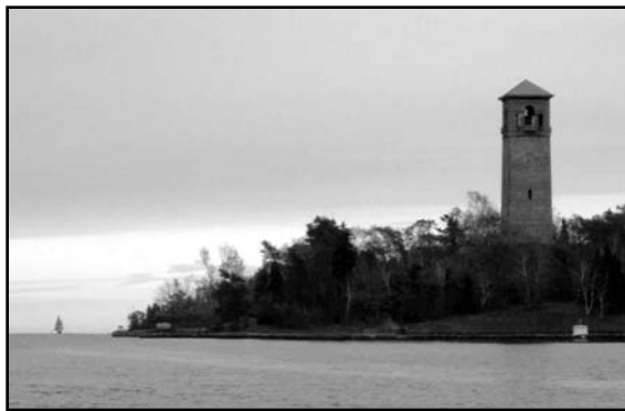
(above) Highlander making her way home Sun, Nov 5/04 (left of the Dingle tower.)