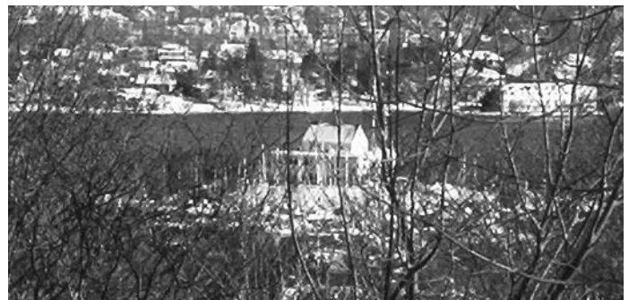
AYC - JAN 04 VIEW FROM HERRING COVE ROAD