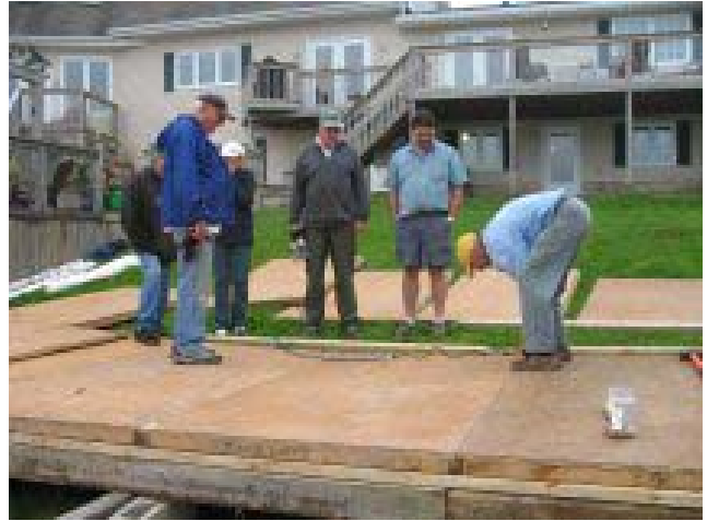
Above - Even before the fleet begins to arrive, there is much pre-work to be done. The question here is...how many "workers" do you see in this photo?!