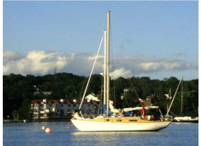
"Awake" on a beautiful day in the AYC Mooring Field on the Northwest Arm