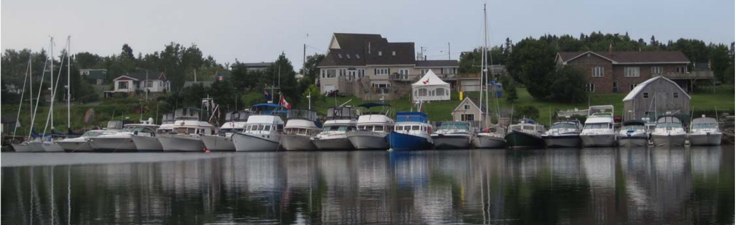
A record number of vessels in the 2010 McGrath's Cove Weekend Raft-Up - more inside!