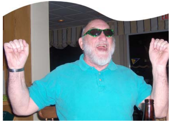
GO ST. PADDY, GO!