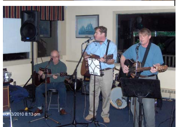
RIGHT: ST. PADDY'S DAY MATINEE FOLLOWED BY OPEN MIKE MARCH 13th