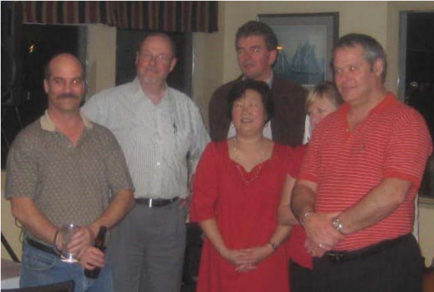
Members & their guests CELEBRATING at AYC!