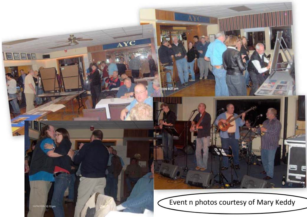
Event n