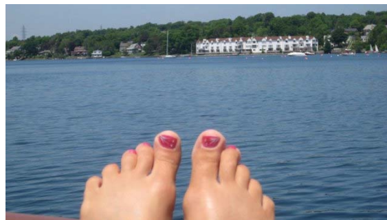
1st Annual AYC Photo Contest Winner, "On the Water" by Bill English!